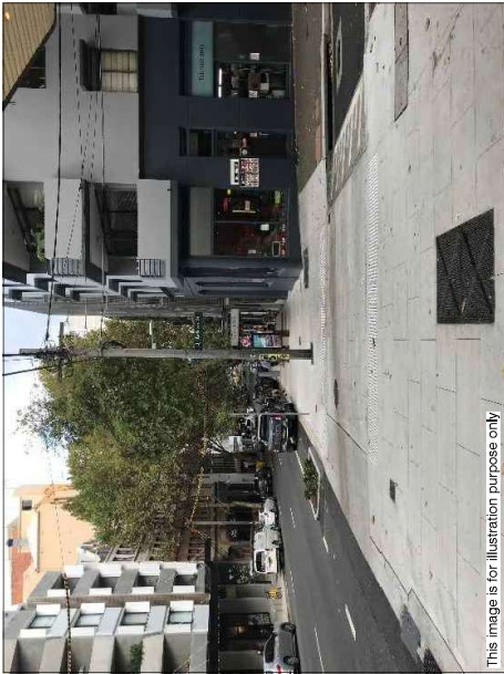
This image is for illustration purpose only